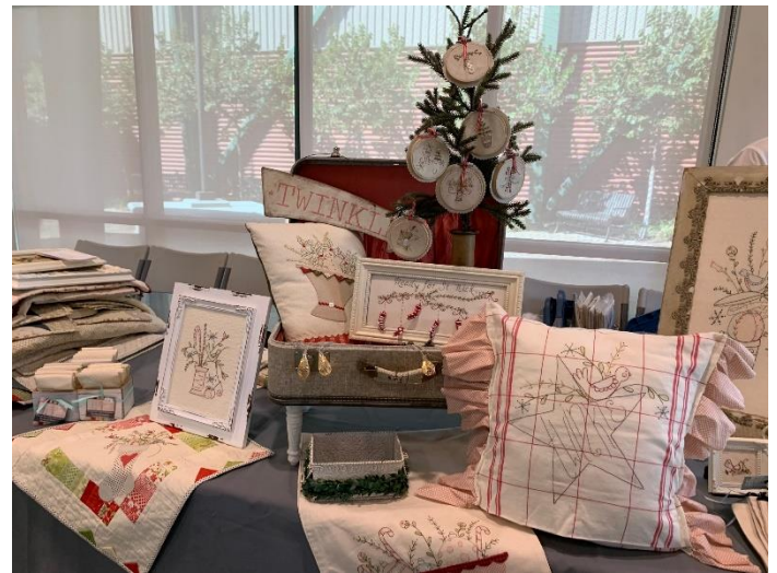
More items our speaker brought for display! Such a talented lady!

Employees made the shop hop "sew" much fun, didn't they? And many thanks to those CPQ members who participated in selling tickets for our opportunity quilt!