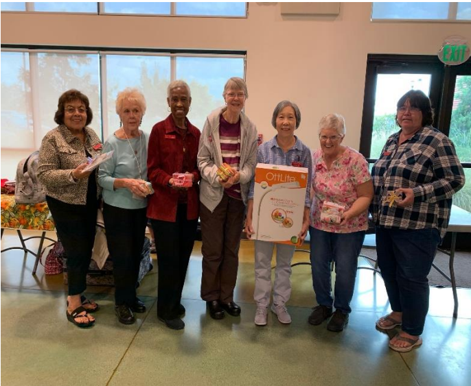
Lucky winners of our Opportunity Drawing during the day meeting! Congratulations, ladies!